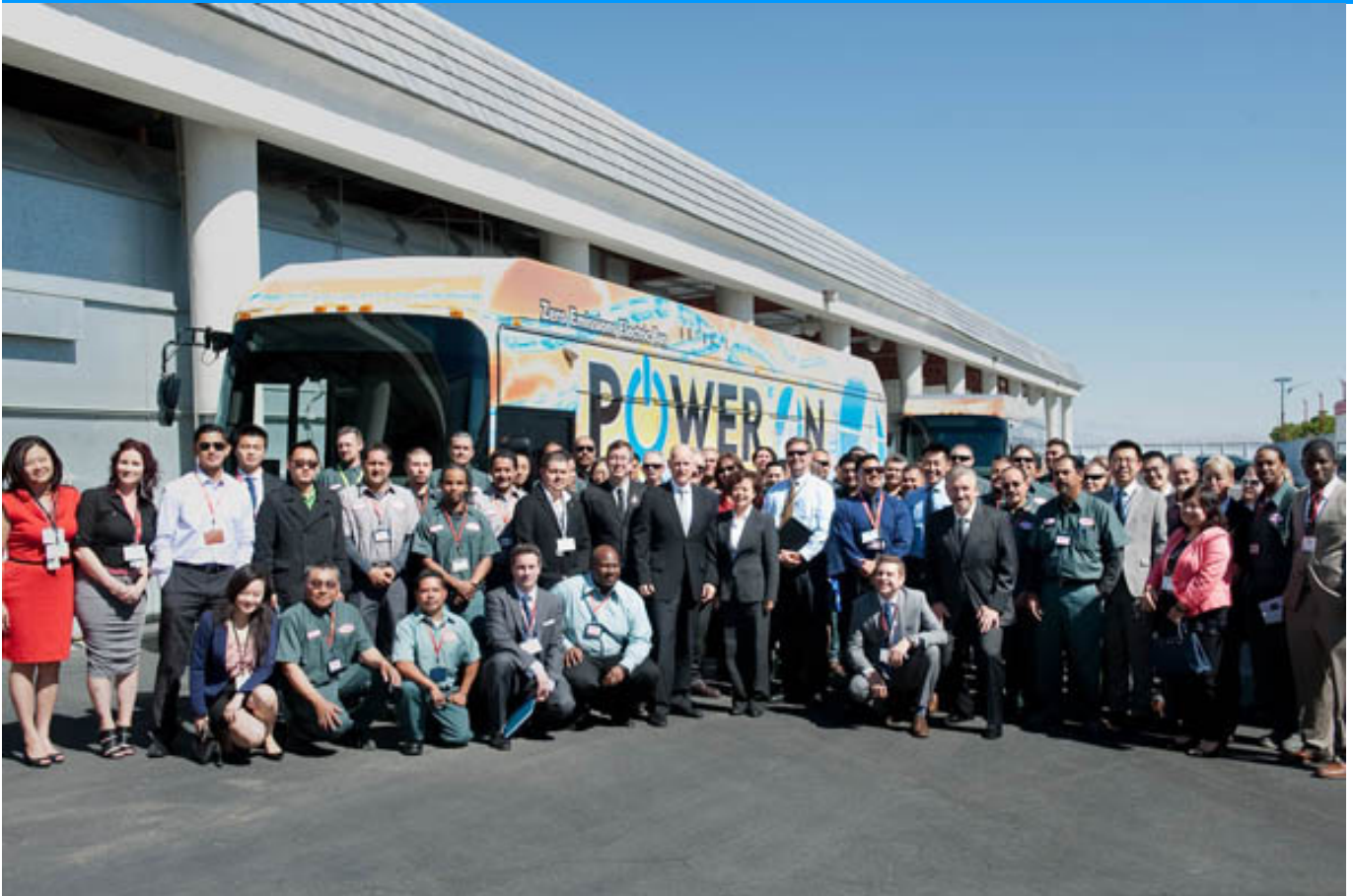
PHOTO CAPTION: Governor Jerry Brown and other California dignitaries attend ceremony for first BYD k9 electric bus built in the state.